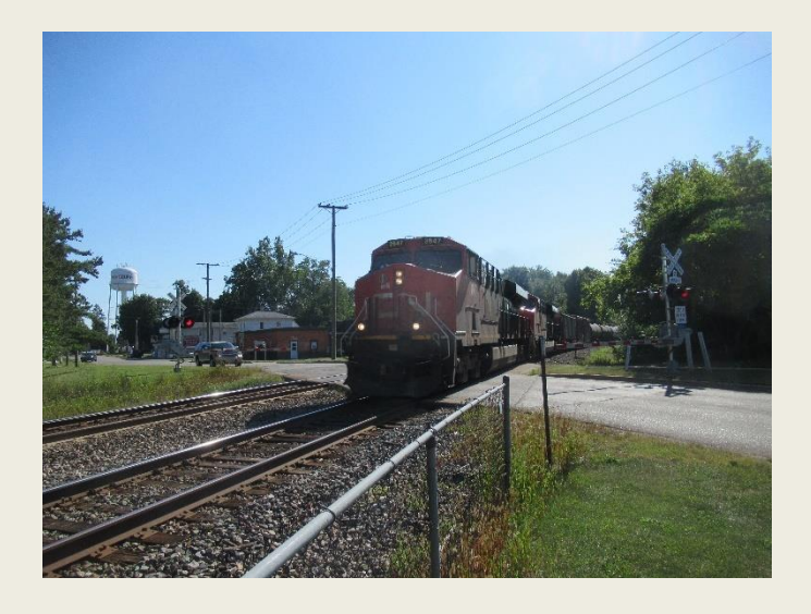
962 - head end