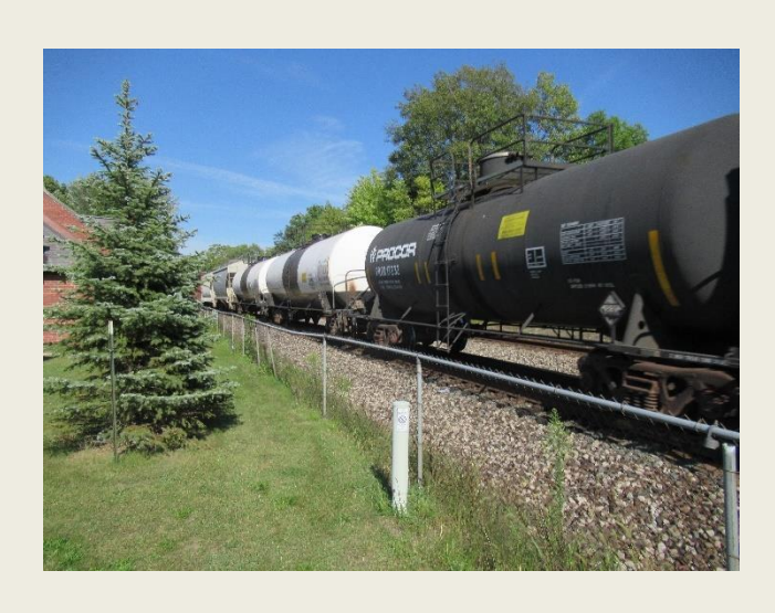
0974 - two white tank cars are DOT 105 tank cars transporting chlorine