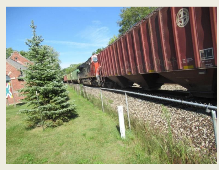
0971 - distributed power in the middle