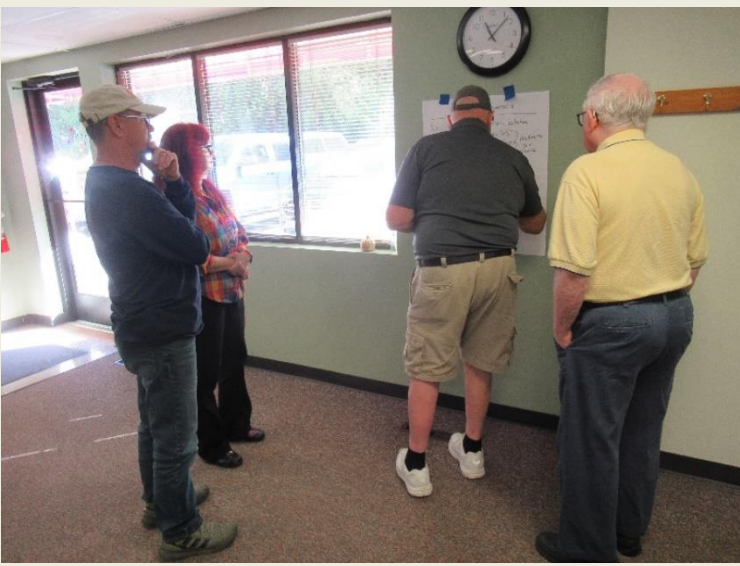
The Yardmaster October 2023